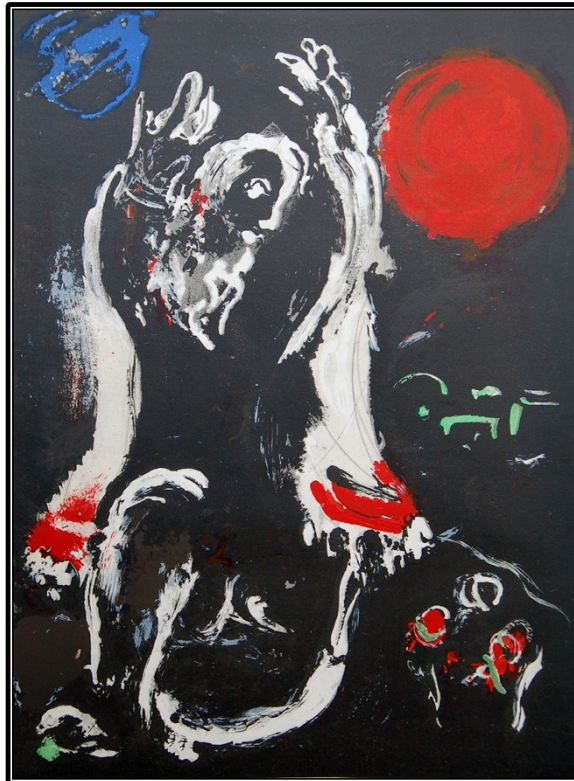
Isaiah Marc Chagall 1956, lithograph

2128 Barton Hills Drive | Austin, TX 78704 512.444.1449 | stmarksaustin.org