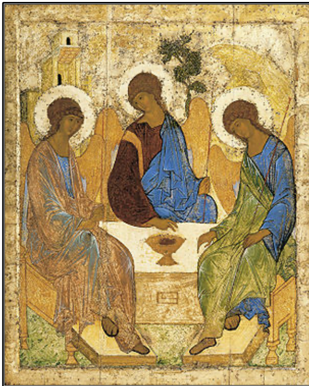
The Trinity Andrei Rublev 15 th century

The Holy Eucharist, Rite Two June 12, 2022 10:00 a.m.